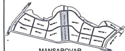
MANSAROVAR KEY PLAN