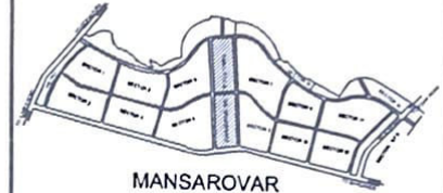
MANSAROVAR KEY PLAN