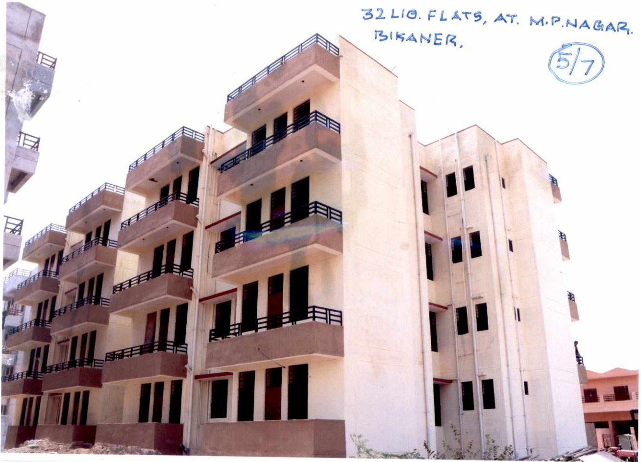
32 LIQ FLATS, MP NAGAR, BIKANER