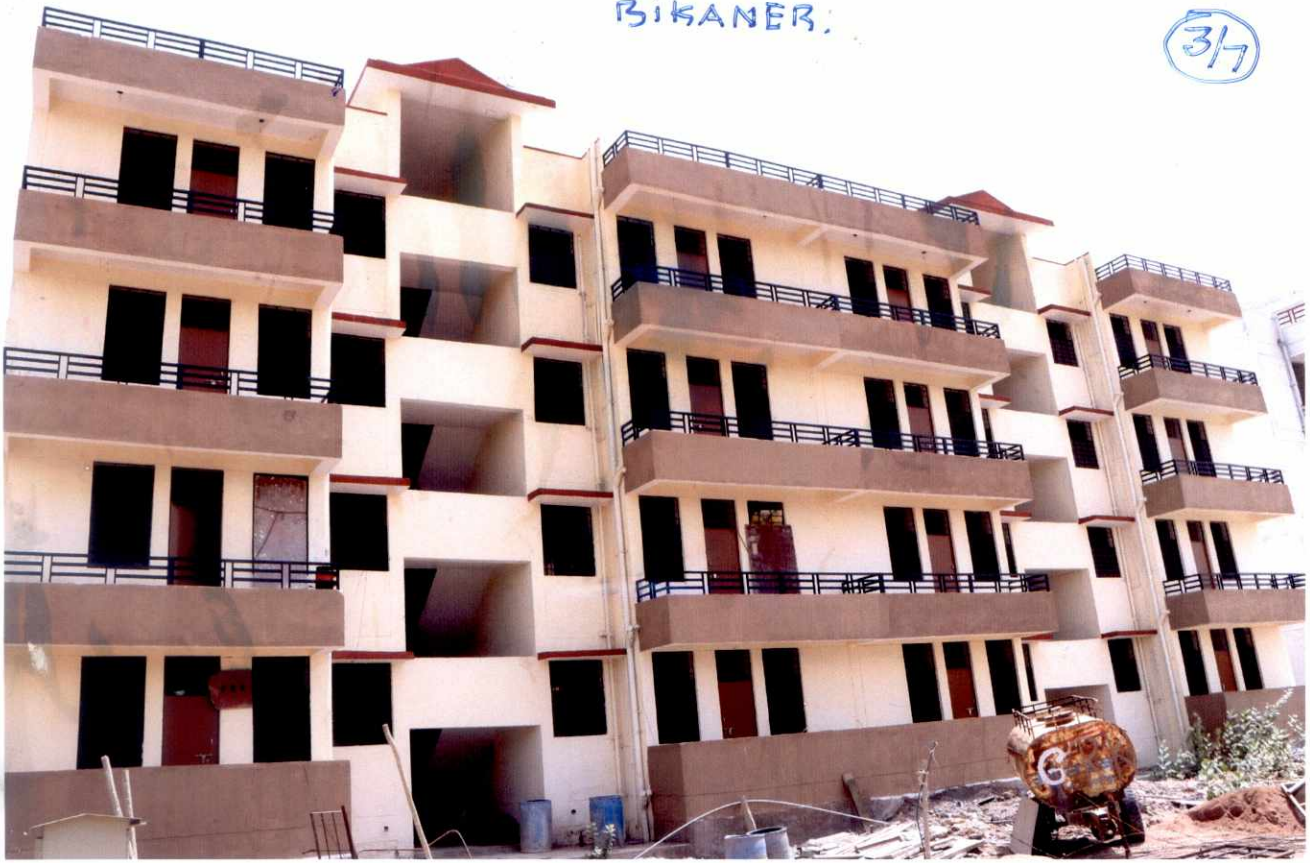
32 LIG FLATS. AT M.P. NAGAR, BIKANER.