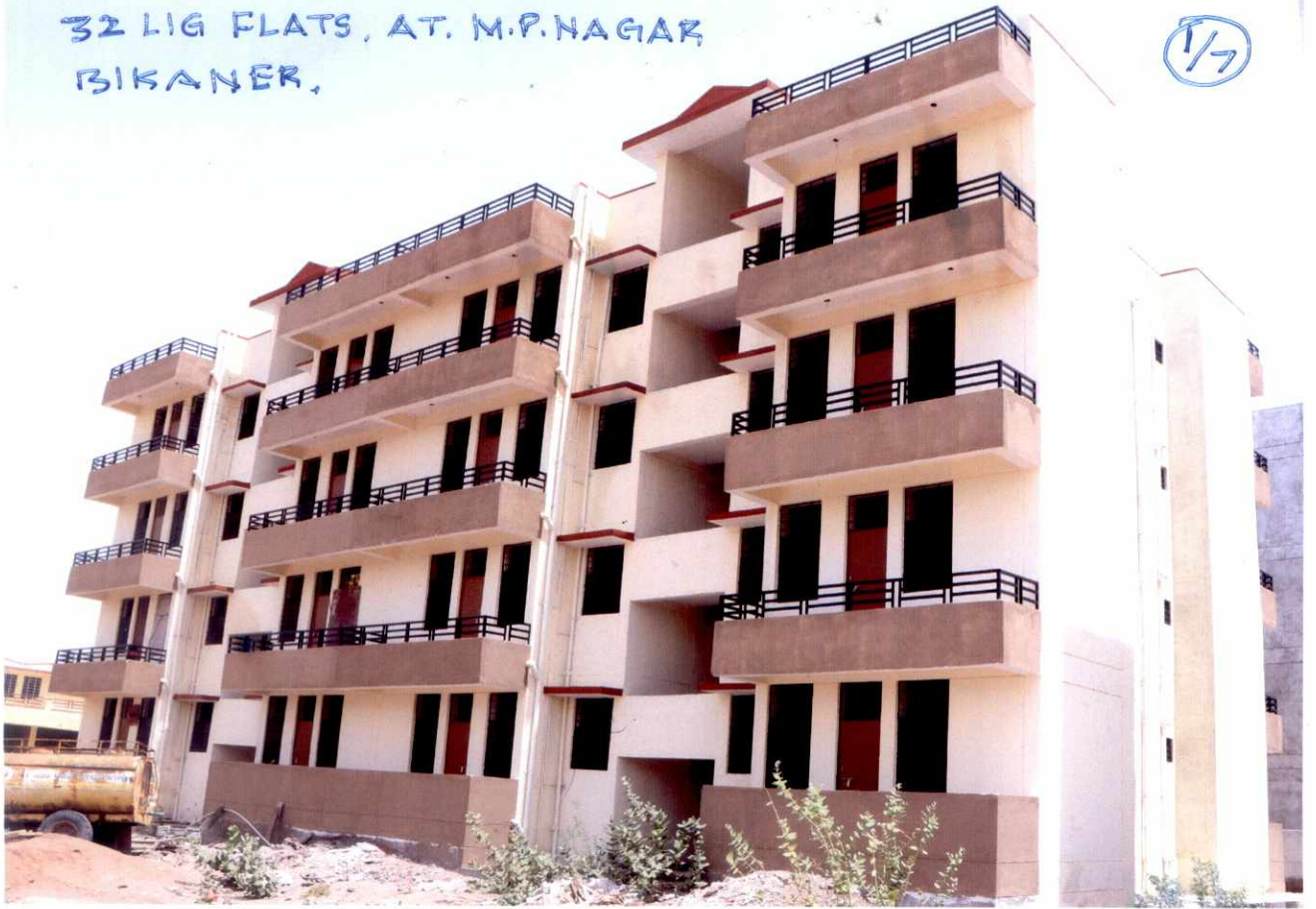
32 LIG FLATS, AT M.P. NAGAR, BIKANER.